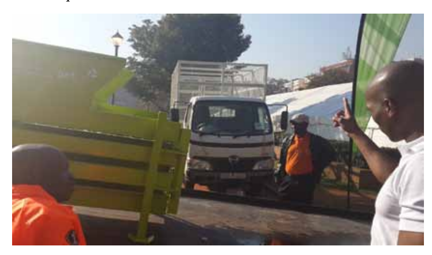
Onderstepoort cooperative receiving sponsor.