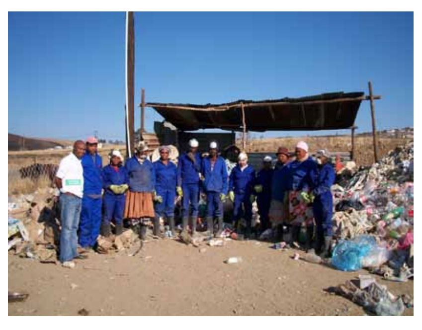
Members of the Mooi River Recycling Cooperative in front of the old shelter housing the baling machine.

In 2008, groundWork started encouraging them to work in pairs and teams if possible. groundWork offered free transport for a period of time for the group in order to facilitate that a small income begin to flow in for the waste pickers. Then they started to sell consistently until the materials buyer made them a better offer; better than local waste pickers who travel less than five kilometres to sell.