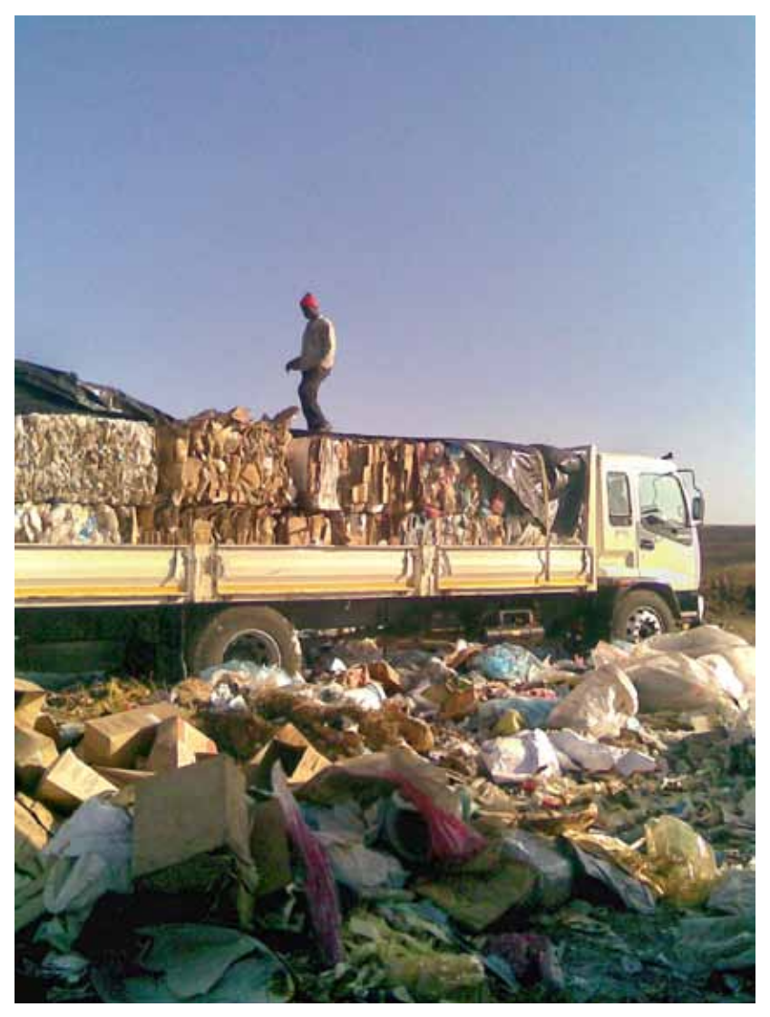
Mooi River Recycling Cooperative loading a truck with bales of cardboard to be taken to the market.

In 2010, the Mooi River Recycling Cooperative was awarded a Seed Award from United Nations Environmental Programme under the Reclaiming Livelihood banner as one of the best recycling initiatives in the country. In 2013, the Provincial Department of Environmental Affairs, as a consequence of the Mooi River Recycling Cooperative's existence, awarded the Mpofana Local Municipality for being the greenest municipality in the province. The project has received wide recognition and SAWPA takes pride in this project. This is a classic example of a true people's project: a project that benefits everyone who is both a worker and a shareholder. The Mpofana Local Municipality also takes pride in this project because real, sustainable jobs are being created without them spending anything. The cooperative's future plan is to implement separation-at-source by getting all the recyclables from businesses in town, later moving on to middle-income households. Eventually, the hope is that everyone in Mooi River will be separating their waste in terms of dry and wet waste.