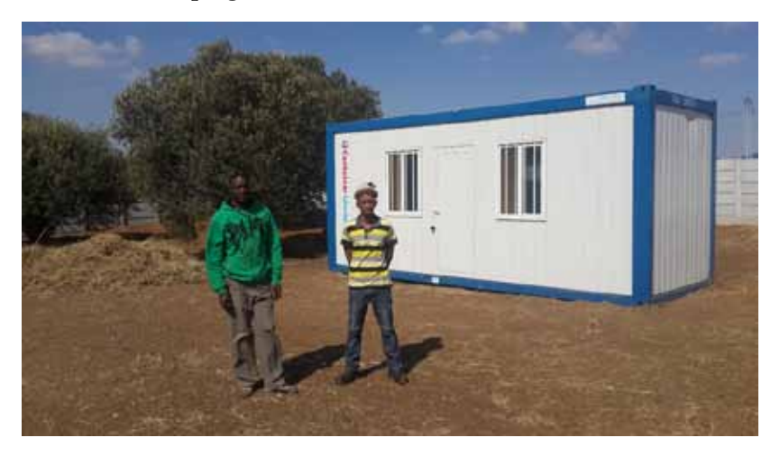
Vaal Park project offices and cooperative members.

Part of SAWPA's goal is to formalise projects in order to be at the front of the line and therefore the Vaalpark project was a dream come true for the Sasolburg waste dump. PACSA invited more and more of its stakeholders to this project and most stakeholders were committed to the success of the project. The land has been secured, trolleys, bins and trucks have either been sourced or have already been purchased. The next steps for the project are the formal launch, and then the education and awareness campaign can start.