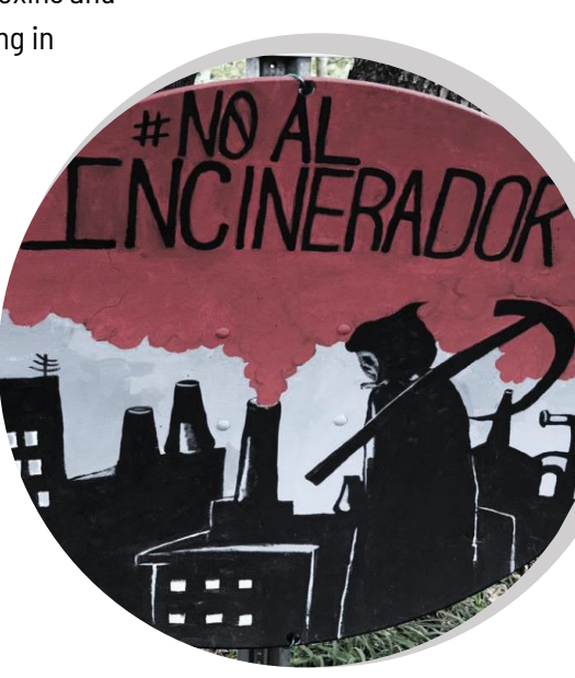
Photo taken in Puerto Rico, in the Arecibo area in which community organizers fought against an incinerator proposal.

Basel Convention listings clearly cover these waste-based fuels in Annex Il to the Convention, under Y46 "Wastes collected from households" when the primary component is municipal waste, or the new plastic waste listing Y48, when the primary component is plastic waste from other sources. Prior informed consent is therefore required for all shipments of waste-based fuels. Governments must clearly identify RDF, SRF, PEF, AFR and other waste-based fuels as wastes, and apply relevant Basel Convention trade controls. Exporters must also ensure to use the correct World Customs Organization's Harmonized System codes, namely 382510 for municipal waste or 3915 for plastic wastes (there are no specific codes for waste-based or "alternative" fuels).