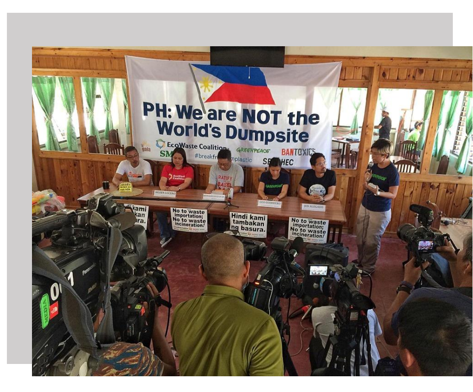
Photo during the press conference at Subic Bay in the Philippines where environment group bids goodbye to Canadian waste and calls on the government to ban all waste imports in the Philippines and ratify the Basel Ban Amendment.

waste economy was thrown into chaos. Malaysia, Indonesia, Vietnam and Thailand became some of the new destinations for global plastic waste flows that they were unequipped to manage, and that was often unrecyclable. The environmental damage from these plastic waste imports became hard to deny, as activists raised the alarm and international media increased its scrutiny. Soon, new South-East Asia destination countries began announcing bans on plastic waste imports.