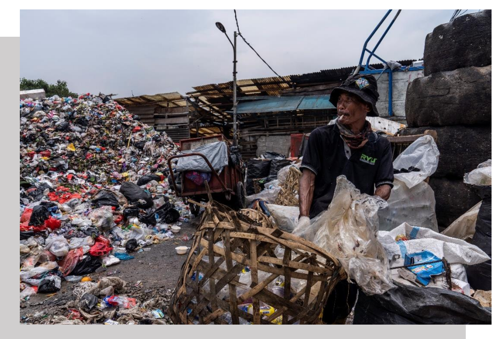
A trash picker collects plastic to recycle from a domestic waste dump in Jakarta, Indonesia on January 23, 2019.

Since the Convention does not define these terms, it is up to national governments to set contamination limits for imported and exported plastic waste in a way that respects the spirit of the Basel Convention, and does not undermine it with vague language or lax standards. Contamination can be measured by mass or by volume. Every national transposition of the Basel Convention plastic amendments carries a risk of undermining the Convention if contamination limits are not clearly defined or are too lax. A binding international standard for contamination limits in global plastic waste flows would resolve this problem.