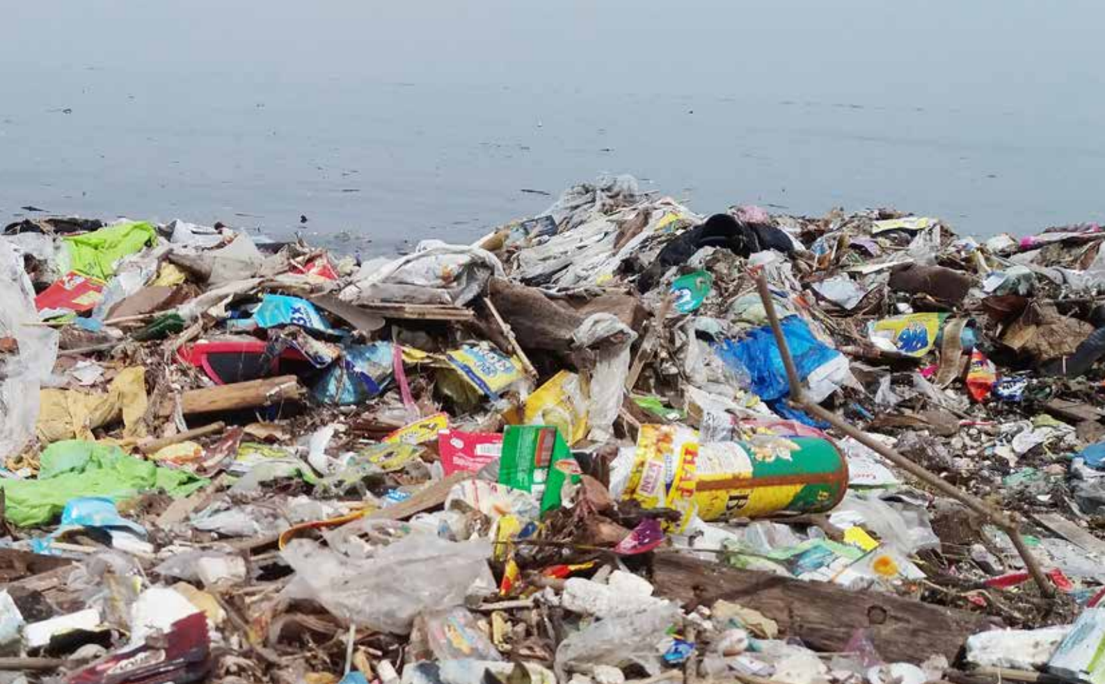
Single-use plastic packaging litter