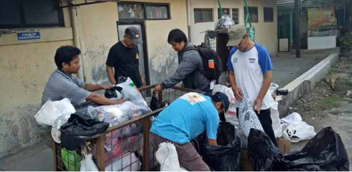
Segregated waste collection in Bandung, Indonesia.