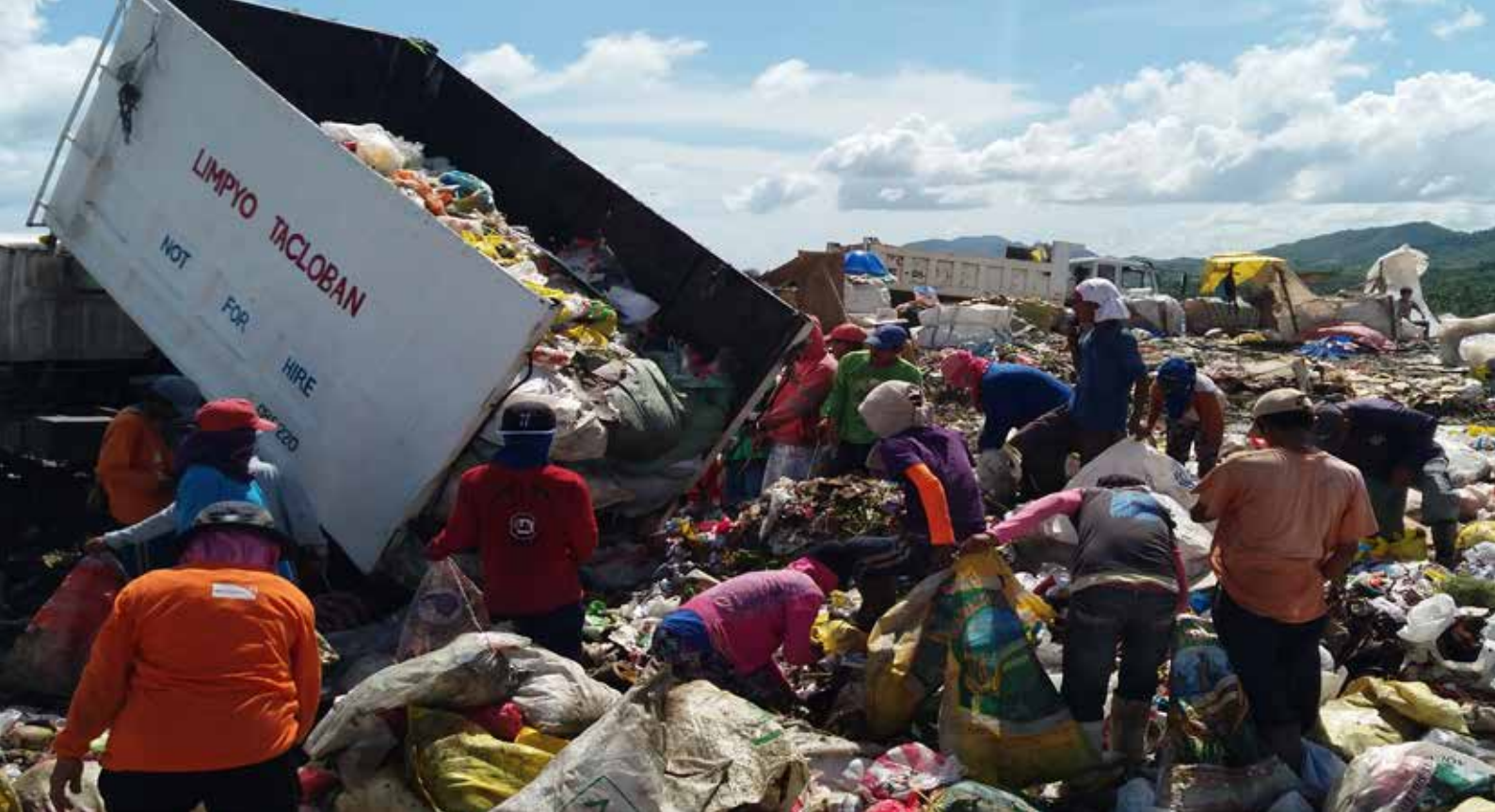
Waste pickers gather around a garbage truck dumping mixed waste in the old dump site in Tacloban City.