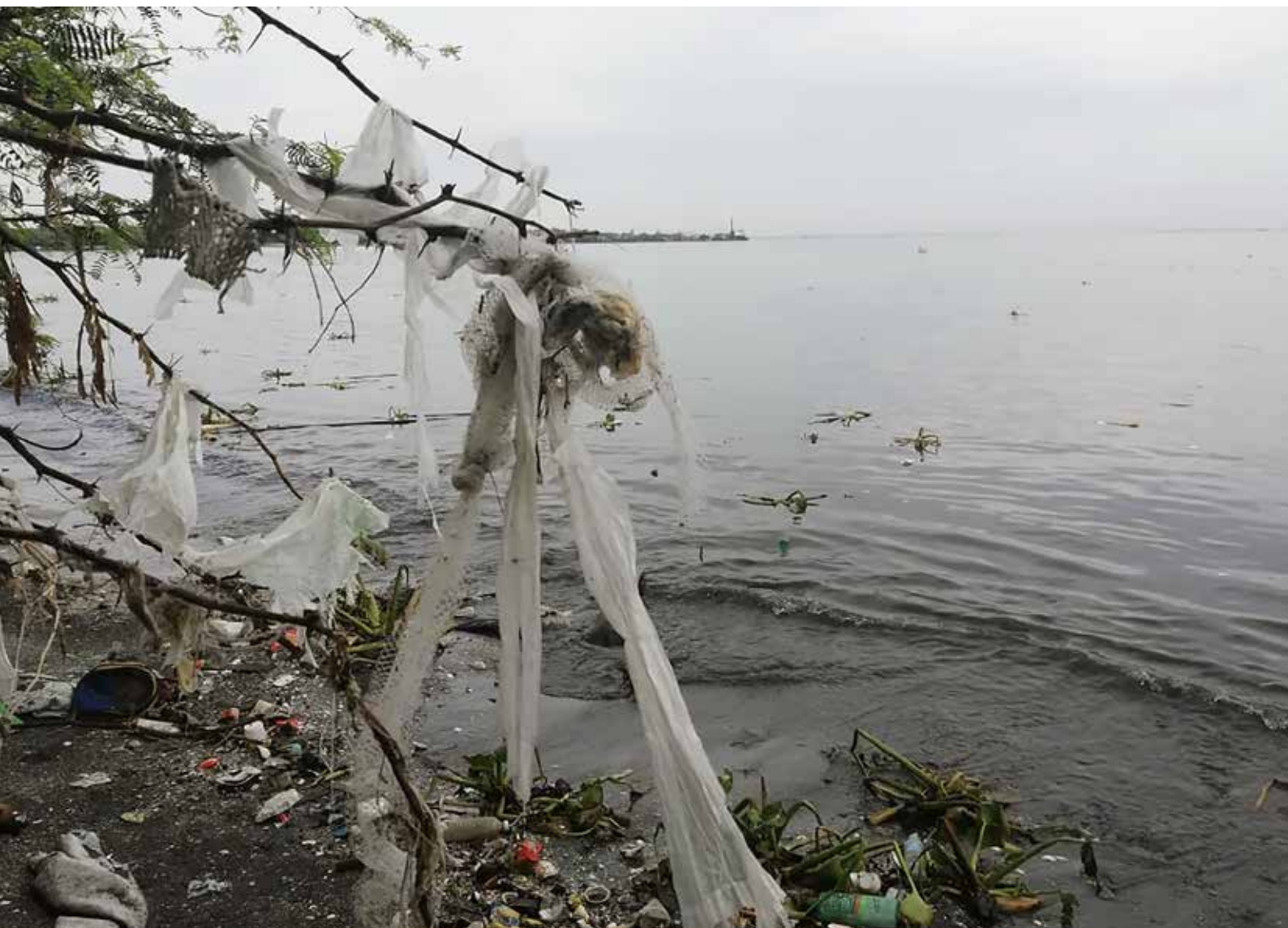
Plastic waste littering Manila Bay

I t is estimated that more than 8,300 million metric tons of virgin plastic have been produced globally. Cheap to produce, plastics have been used for a variety of purposes, from car parts to product packaging. However, its end-of-life management, particularly for plastics that are single use in nature, is currently in question: only around 9% of discarded plastic have so far been recycled. The rest are either burned, landfilled, or released into the environment (e.g. waterways, streets, etc.) 3 .