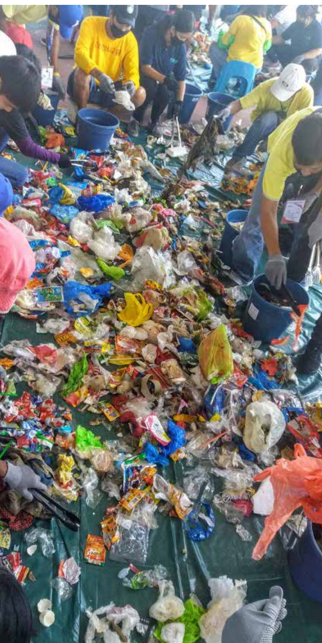
Table 1 above lists the sites where brand audits were conducted in connection to the brand audit research. No national extrapolation of data on branded packaging was conducted.

Conducting a household brand audit 24 as the next step to a waste assessment enables cities to identify which brands, products, or companies are commonly used in the area and are accountable for a particular percentage of the waste. In a brand audit, waste, particularly plastic residuals, is classified into branded (according to brand name and producer) and unbranded packaging. Unbranded packaging is further classified according to plastic material such as plastic labo bags (thin film), plastic sando shopping bags, and generic plastic packaging (those without labels), among others. Branded packaging is additionally classified according to type of material (laminates or single-layer plastic) and manufacturer information.