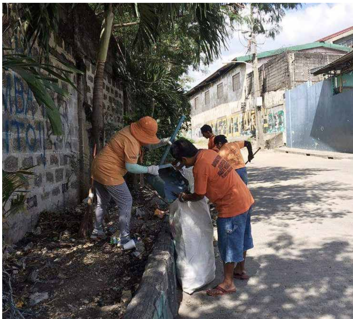
The Ladies Brigade in action. The group plays a crucial role in the successful implementation of Zero Waste programs in Potrero, Malabon City.