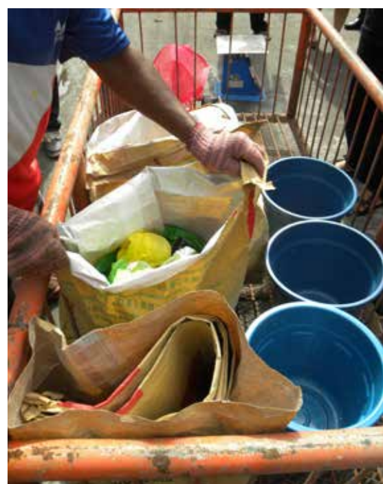
Waste workers use push carts in collecting segregated waste from house to house in Dumaguete (left) and Malabon (right).