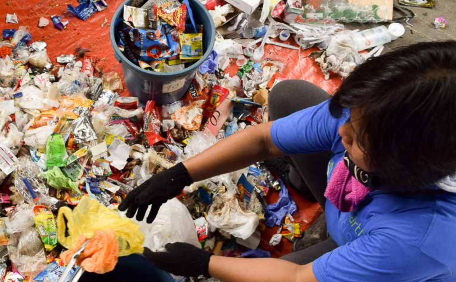
MEF volunteers sort branded plastic residuals during a waste audit in Quezon City

and local government project partners, with the support of GAIA and funding from the Plastic Solutions Fund. Results from the 21 waste assessments were used to extrapolate national data, including estimates about the use and disposal of different types of plastic residuals. Among the 21 sites where waste assessments were conducted, 15 sites have additional brand audit data. These data provide a snapshot of how much plastic waste, particularly those with branded packaging, are discarded by households.