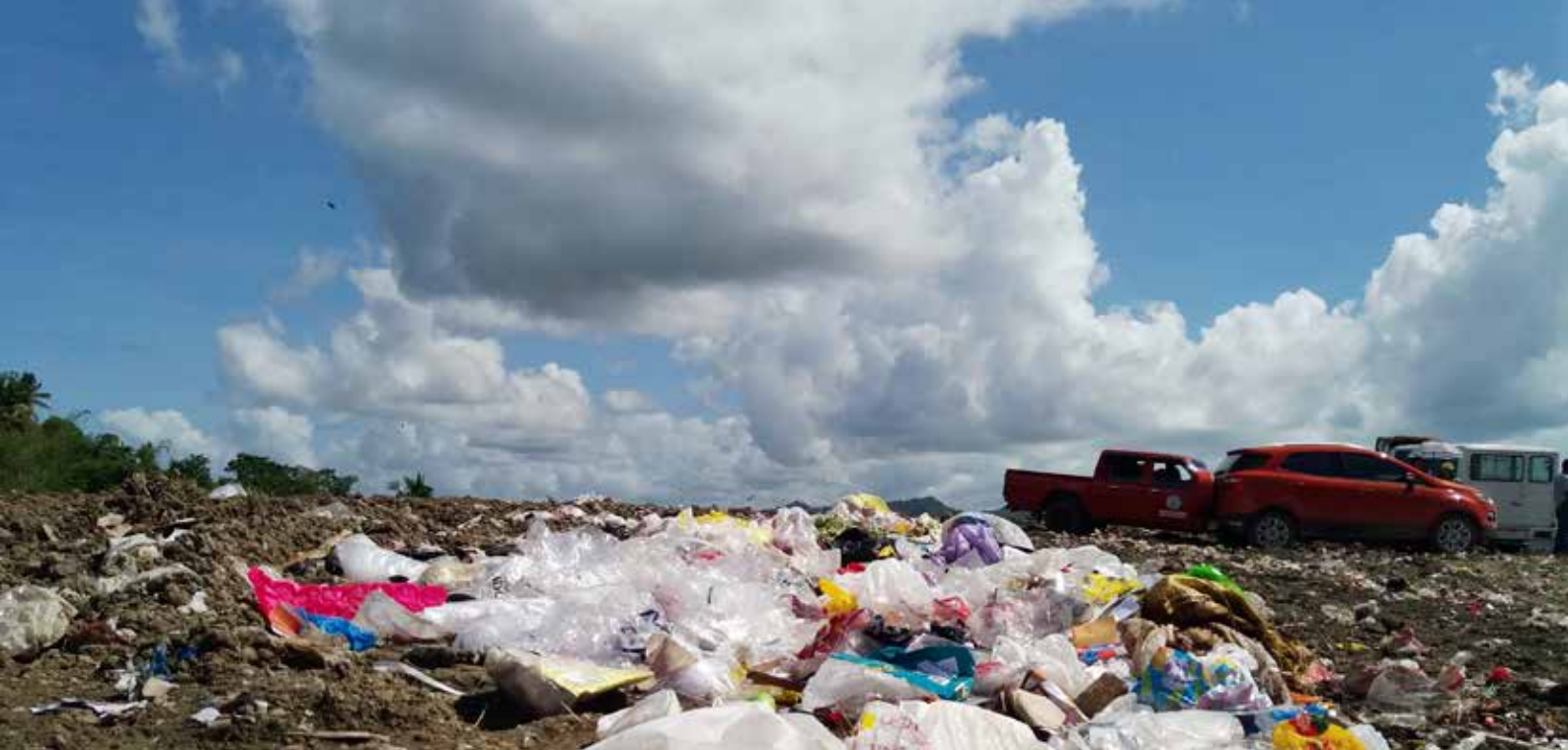
Plastic waste that has leaked that has leaked into the environment