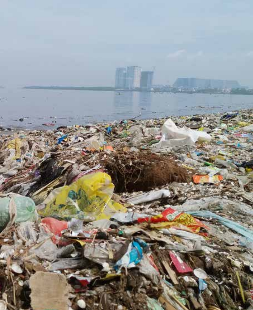
Plastic packaging polluting Freedom island off Manila Bay

The WABAs clearly identify sachets as a major cause of plastic pollution, comprising the biggest portion of residual waste. Regulating, and eventually eliminating the production of sachets will have the biggest impact in reducing the country's residual waste.