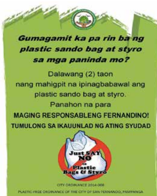
Sample poster used by the City of San Fernando in their IEC campaigns.

Population density: 4,500/km 2 Total land area: 67.74km 2