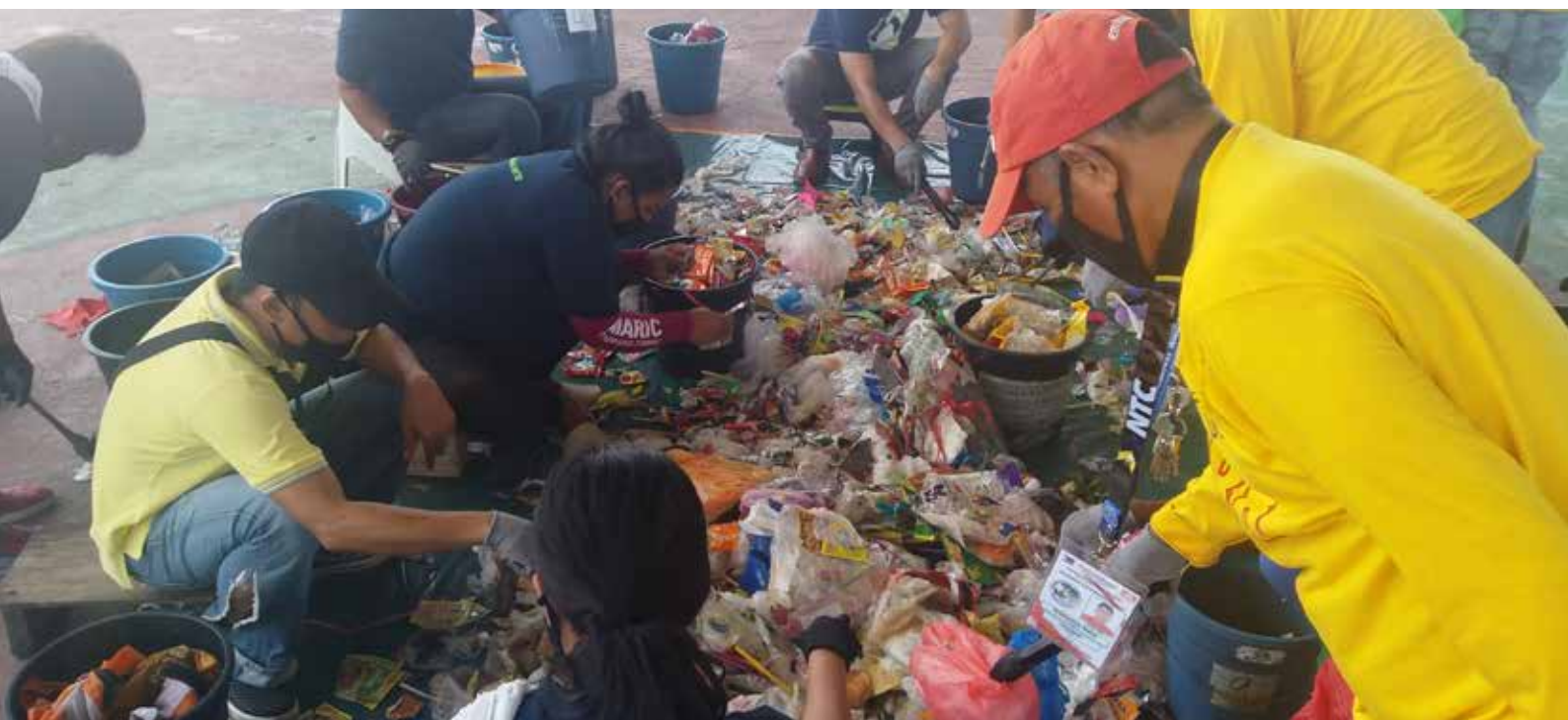
Volunteers sort plastic residual waste in Tanza, Navotas.

Barangay Tanza 2, Navotas City National Capital Region