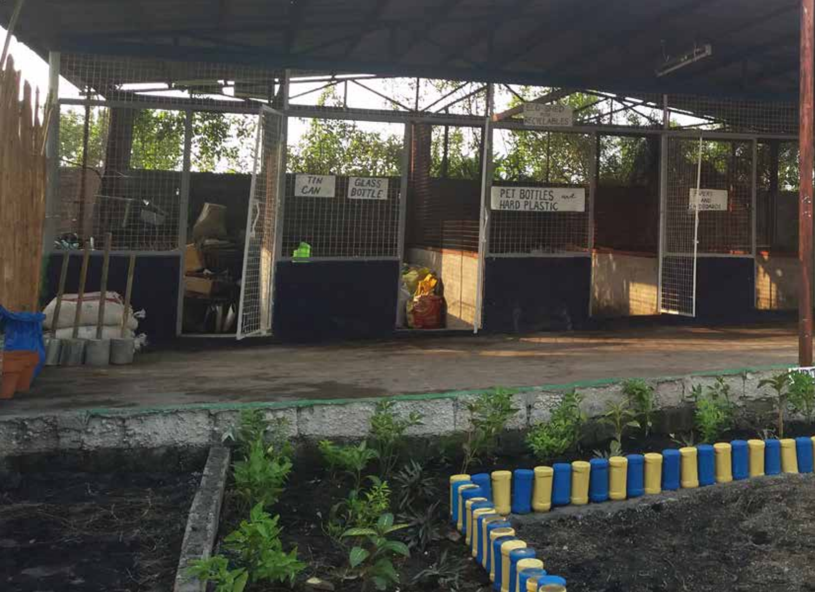
A materials recovery facility (MRF) in Malabon City. Functioning MRFs typically have composting areas for biodegradables and temporary storage rooms for recyclables.

As a tool, WABA helps 1) expose the role of corporations in the global proliferation of plastic waste; 2) unmask how the industry has passed on the blame for the waste they produce to the consumers of their products, and the responsibility for the clean-up of their packaging to governments 12 ; 3) reinforce the need for corporations to accept liability for the full life-cycle impacts of their products and the packaging in which their products are sold.