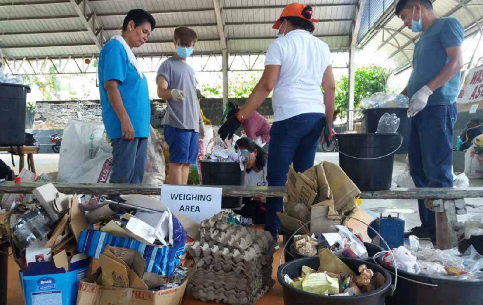
MEF staff and Zero Waste Academy participants weigh recyclables during a waste assessment and brand audit in Dumaguete City.

Using WABA data, this research extrapolates national estimates on annual per capita use of plastic shopping bags, plastic labo, and sachets in the Philippines. Findings show that: