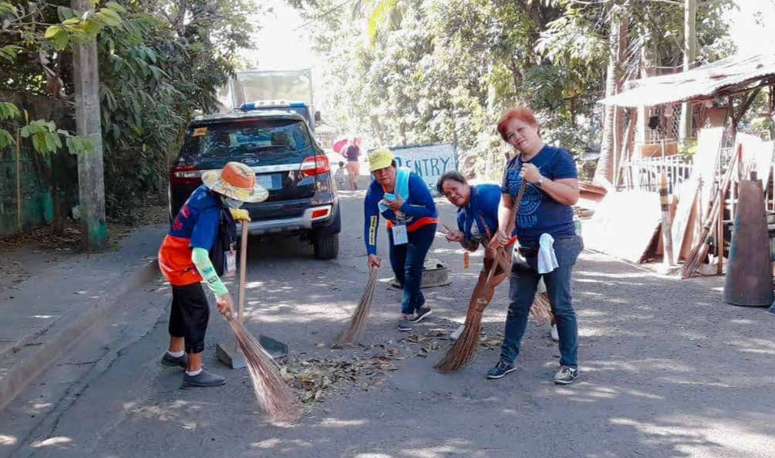
Members of the Ladies Brigade of Potrero, Malabon City pose for a photo during a cleaning activity.