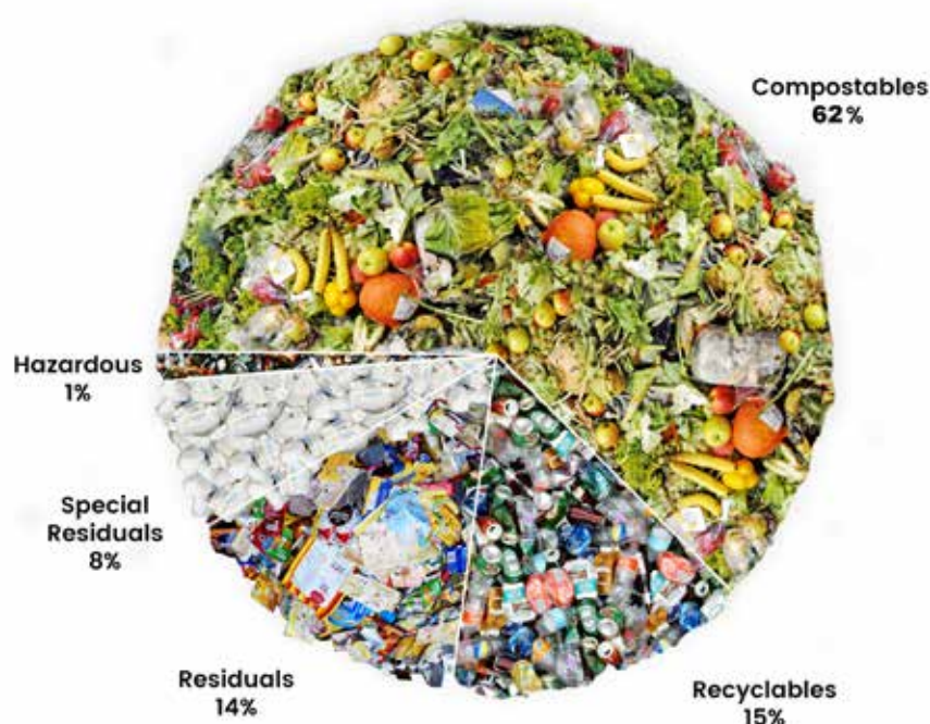
Figure 1. Waste characterization of household waste in the Philippines*

Waste assessment protocols described in the DENR WACS manual used in the Philippines do not require a distinction between the different types of residuals although these residuals vary very widely in terms of form and material. These residuals may be composed of multi-layered composite plastic packaging typical of processed food and other goods, sachets, shopping bags, thin film bags, utensils such as cutlery, straws, etc., and other packaging and disposable plastic-based materials. This disaggregation is included in the MEF and GAIA waste assessments.