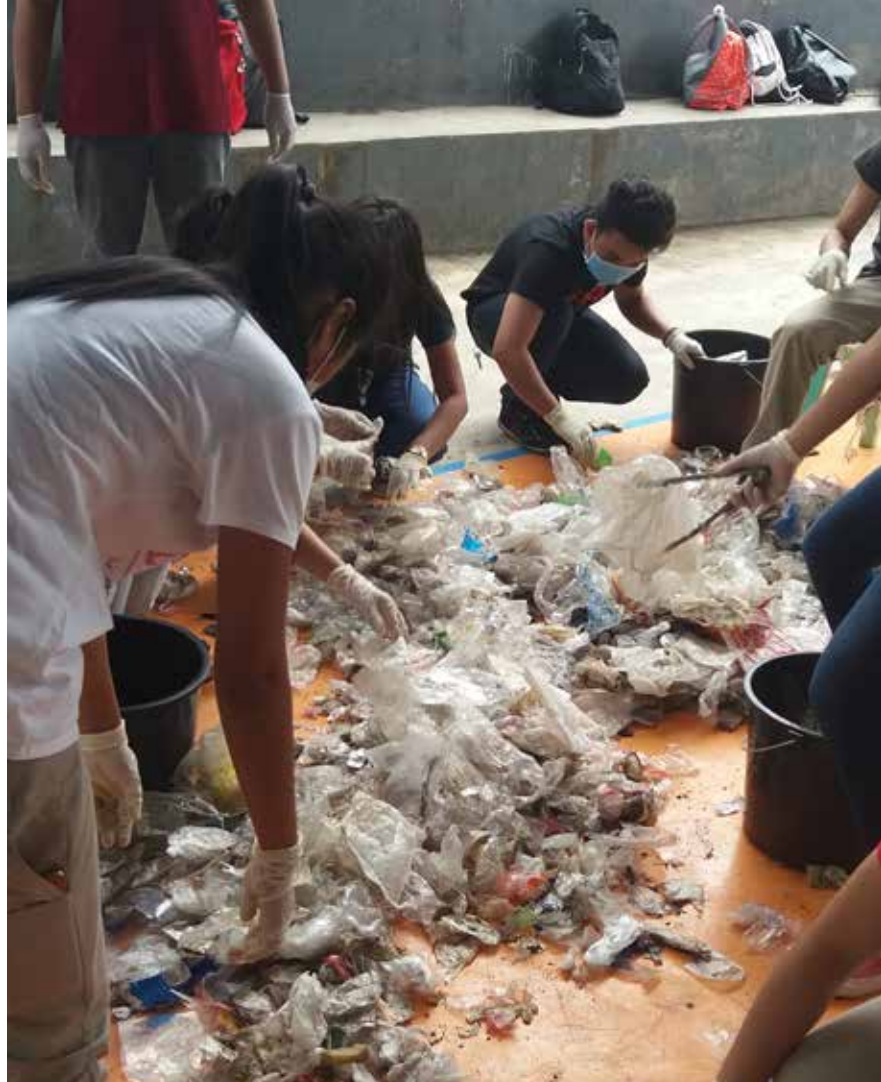
Volunteers count pieces of thin, transparent plastic bags (also called plastic labo bags in the Philippines) during a waste assessment and brand audit in Dumaguete City.

MEF developed a WABA toolkit in 2018 11 .