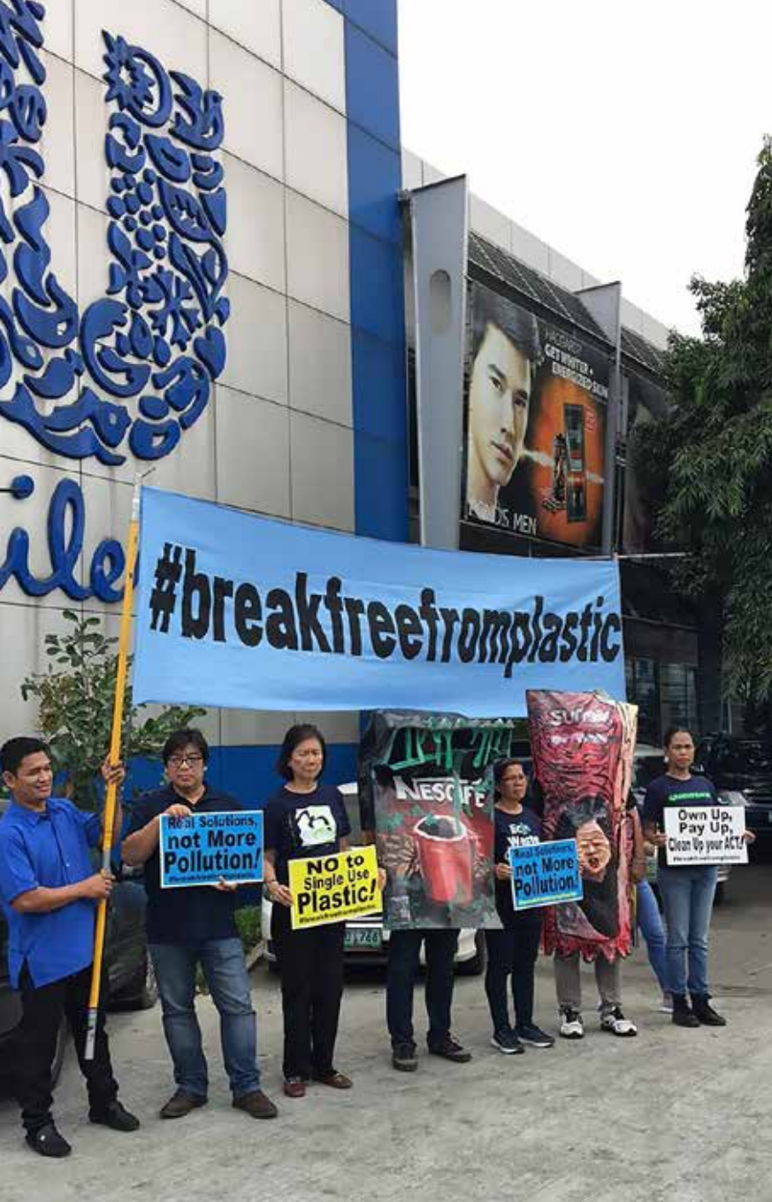
Results of the WABAs allow GAIA to identify the sources of plastic pollution and call on them to assume responsibility for their products and dramatically reduce their production and use of single-use plastic.