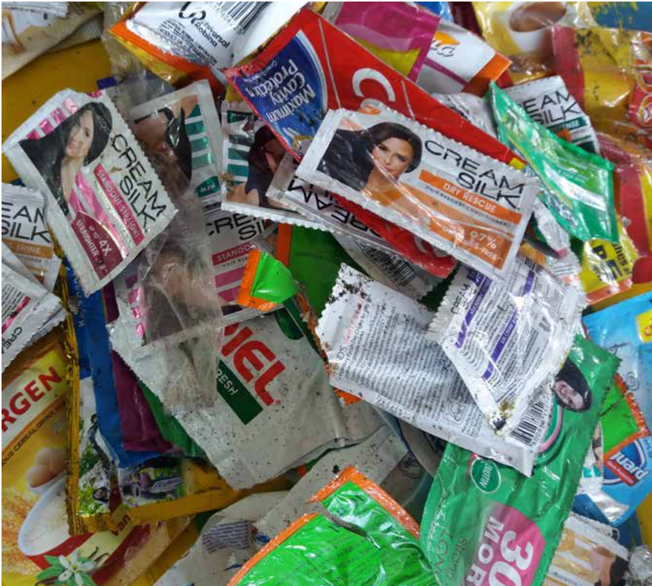
Sachets collected during a brand audit. GAIA estimates that almost 164 million pieces of sachets are used daily in the Philippines.

organics, and maximizing recycling of high-value materials, etc.) cities can only achieve a maximum of 70-80% waste diversion (i.e. maximizing the sustainable management of discards to avoid landfilling and other final disposal methods) compared to their pre-Zero Waste program baselines. Despite expanding Zero Waste strategies, cities and municipalities will be left with around 20% of waste that they cannot manage—sachets and other single use plastics—preventing them from fully achieving Zero Waste goals.