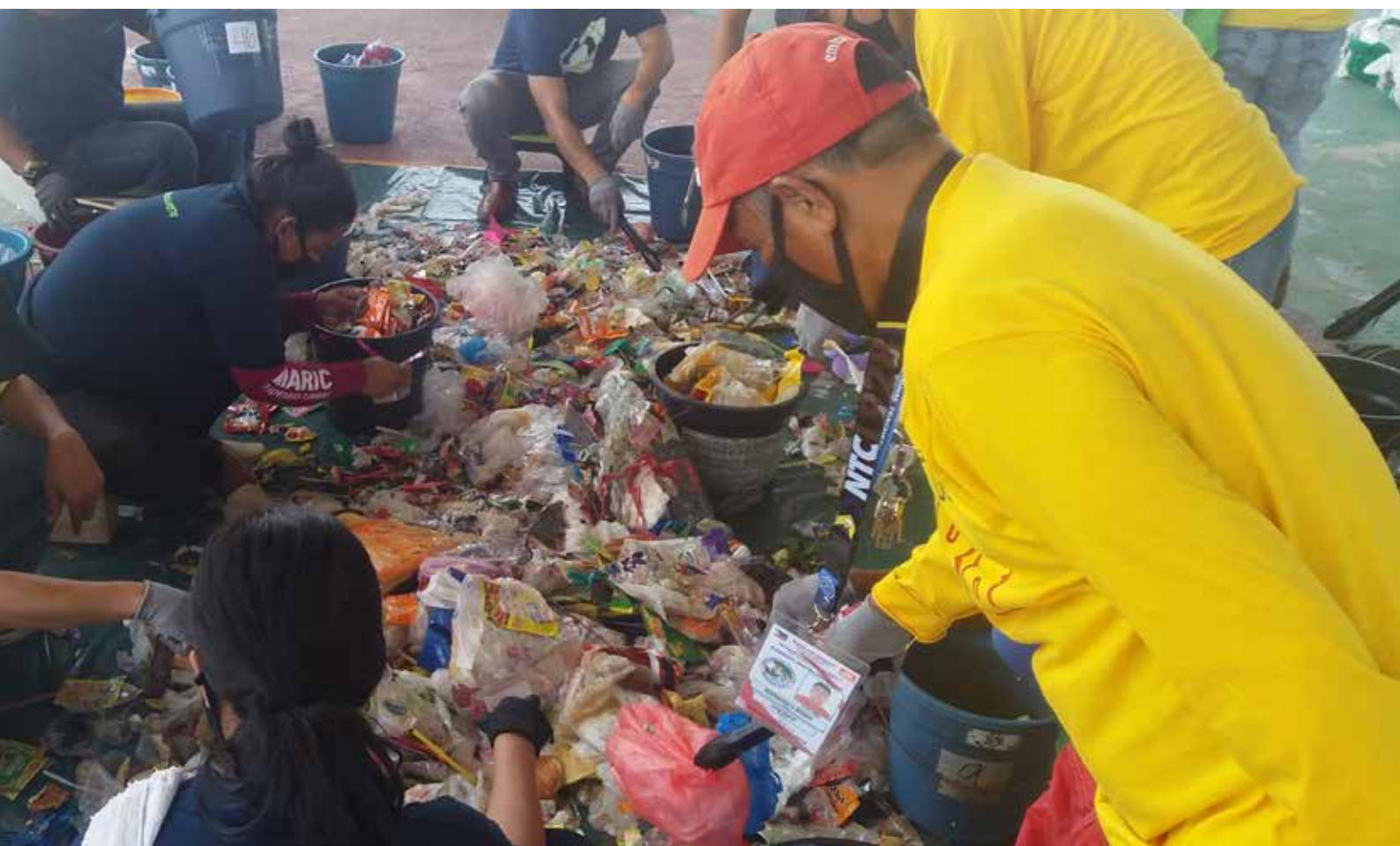
Table 10 lists the companies with the most number of branded residual waste identified in the household brand audits, and the corresponding percentage share of the company's residuals compared to the total number of residual waste (branded and unbranded) audited, and compared to the total number of branded waste. This and other lists from previous brand audits aim to reveal which companies are the top sources of single-use, disposable packaging in the areas where the brand audits were conducted.

From the brand audits conducted, all data were compiled and ranked to produce a list of companies identified as the sources of the most number of residual plastic waste found in these areas.