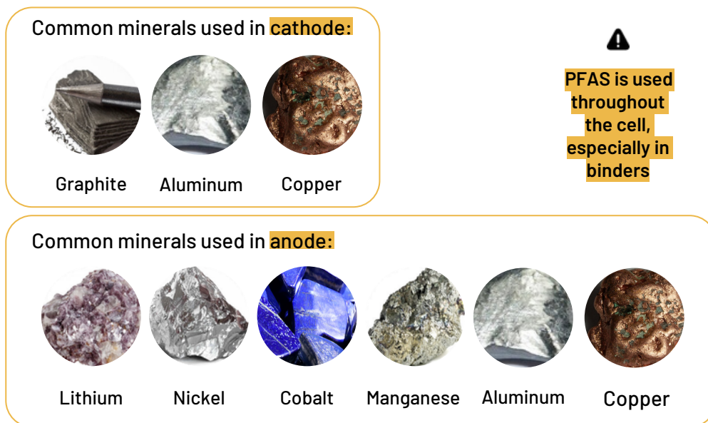
FIGURE 2: Main components of a lithium-ion cell