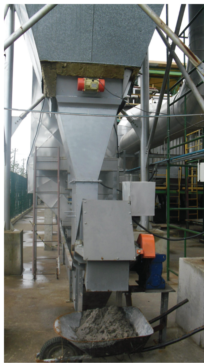
Part of the filtration equipment and fly ash from Usina Verde S/A

is relatively low, around R$ 35 – 50 (US$ 20-29) per ton. 12 So companies need to look for financial incentives, including climate funds, to make their projects economically viable.