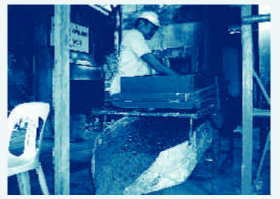
Mature composts are sieved before repacking to ensure good quality.

The barangay generates about 407 kg of waste daily. Food waste collected is about 204 kg. Three Barangay Tanods collect 12 drums of 17 kg capacity everyday. Garden waste (28 kg) is shredded and (continued next page...)