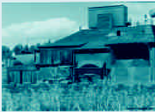
Byker incinerator in UK.

In industrialized countries, incinerator air pollution control equipment lessen the release of many air pollutants but they also increase costs significantly. The better the pollution control and regulatory oversight, the higher the costs. In the United Kingdom for example, around 30% of the capital costs of a conventional British incineration facility is attributable to the flue gas clean-up system.<sup>31</sup> In the Netherlands, a 1,800 tonne-per-day facility, which went on line near Amsterdam in 1995, cost US$600 million with half the investment going into air pollution control.<sup>32</sup> In the United Kingdom, owners of the Sheffield incinerator spent over 28 million pounds (~US$40 million) bringing the facility up to the new European standards. As a result, the local government council can no longer afford to service the debt on it and plans to sell it.33 In Korea, safety requirements have doubled the