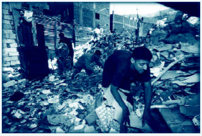
Zabbaleen sorting out cardboards and papers in Mokattam, Egypt.