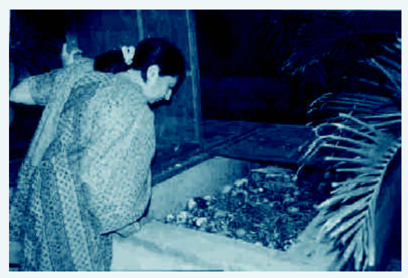
A big tub where compostable materials are processed.

spray water to maintain the temperature below 30 degrees Celsius. Bins have to be in the shade for the earthworms to do their work. Worm castings or compost humus produced from the worms is a valuable soil conditioner. It becomes the property of the ragpickers and provides some additional income earnings when they sell the product to farmers. Through these vermicomposting plants, which have minimal start-up costs (Rs 20,000 at most -~US$400), the MCGM saves RS 1,100 per tonne -~US$22 — in avoided handling and disposal costs.