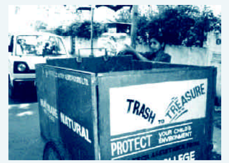
Pushcarts are designed to motivate community members to participate in waste segregation.

Exnora International's model zero waste program for the Civic Exnoras involves setting up three meetings to facilitate resident participation and