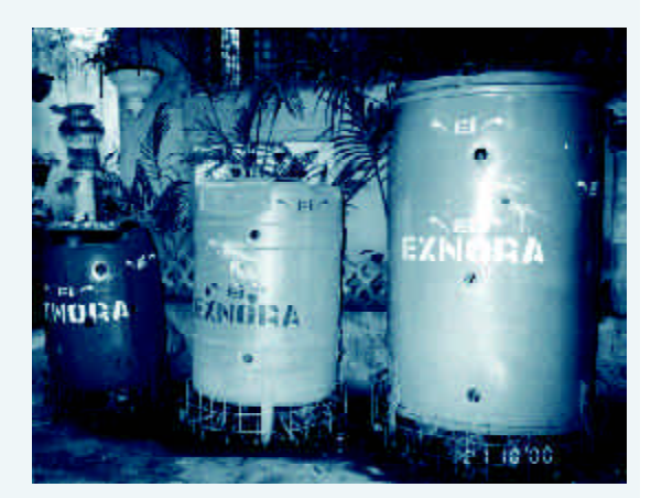
Collection bins are color-coded to make segregation easier.

Resources up in Flames: The Economic Pitfalls of Incineration versus a Zero Waste Approach in the Global South