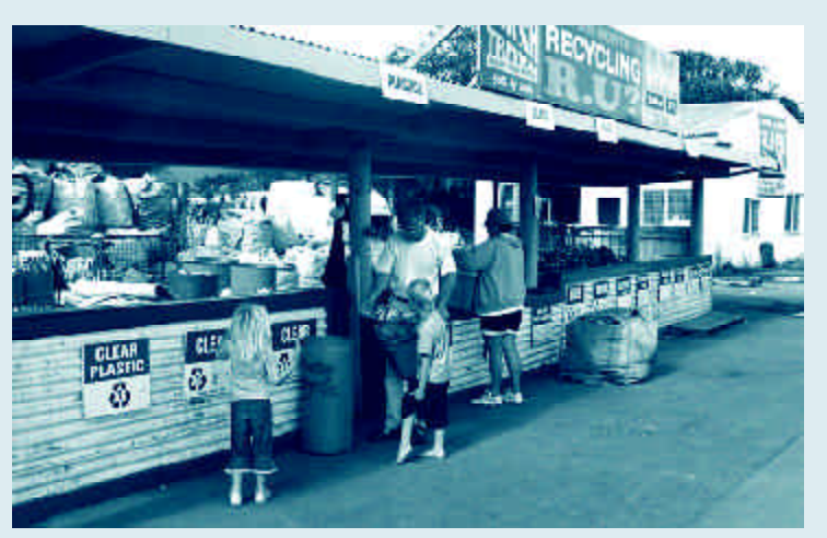
A "recycling wall" at Kataia, New Zealand operated by the Community Busines Environment Centre (CBEC).

Source: Zero Waste New Zealand Trust web site http://www.zerowaste.co.nz, visited December 2003; and Warren Snow, Zero Waste New Zealand Trust, New Zealand, personal communication, June 25, 2001.