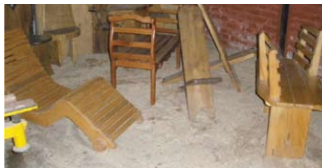
Furniture made out of scrap wood in La Pintana.