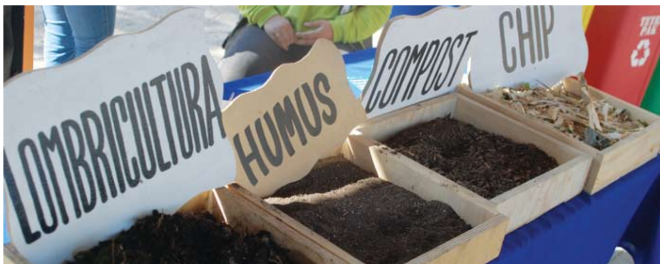
Education activity showing outcomes of vegetable waste recovery.

The Chilean community of La Pintana has found that recycling their largest segment of waste—fruits, vegetables, and yard clippings—can save them money, produce valuable compost, and reduce greenhouse gas emissions. The program cost very little to initiate and has grown steadily for seven years, through an ongoing education campaign about source separation for residents who reap benefits in the form of new trees and public parks. Though participation rates are still modest, La Pintana's vegetable waste 1 recovery program is already making a substantial contribution to the community's financial and environmental sustainability.