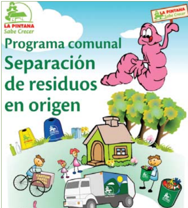
Leaflet to promote source separation. (poster: DIGA)

difficult, and the one that creates greenhouse gas emissions and leachates in landfills. The program was built upon existing infrastructure and local financial resources. It has been steadily growing since its launch, and while it still has only modest participation rates, there is an ongoing effort to increase participation whenever the budget allows for more public education campaigns.