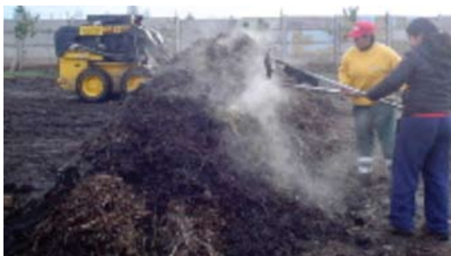
Compost plant in La Pintana.

Once collected, the source separated vegetable waste is transported to a 7,500 m 2 treatment plant located within the commune. The site includes a 5,000 m 2 compost site that handles 18 tons of vegetable waste per day. It also includes a vermiculture area of 2,000 m 2 , with 136 worm beds 15 meters long, that treats between 18 and 20 tons of vegetable waste per day. Total input in this plant, including vegetable waste from households and street markets as well as yard trimmings, is 36 - 38 tons per day. The waste arrives very well separated, with only 0.04 percent of impurities (mostly plastic bags that some people still use in the containers). Four people work at the site, each