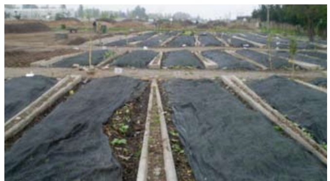
Worm beds in La Pintana.

With this data in hand and the system designed, in December of 2005 the municipality launched its new program. Unlike many materials recovery strategies adopted in Latin America, this one did not focus on recycling dry materials, but on recovering vegetable waste. This decision was fundamental, since vegetable waste is the largest waste stream, the one that makes recovery of recyclables more