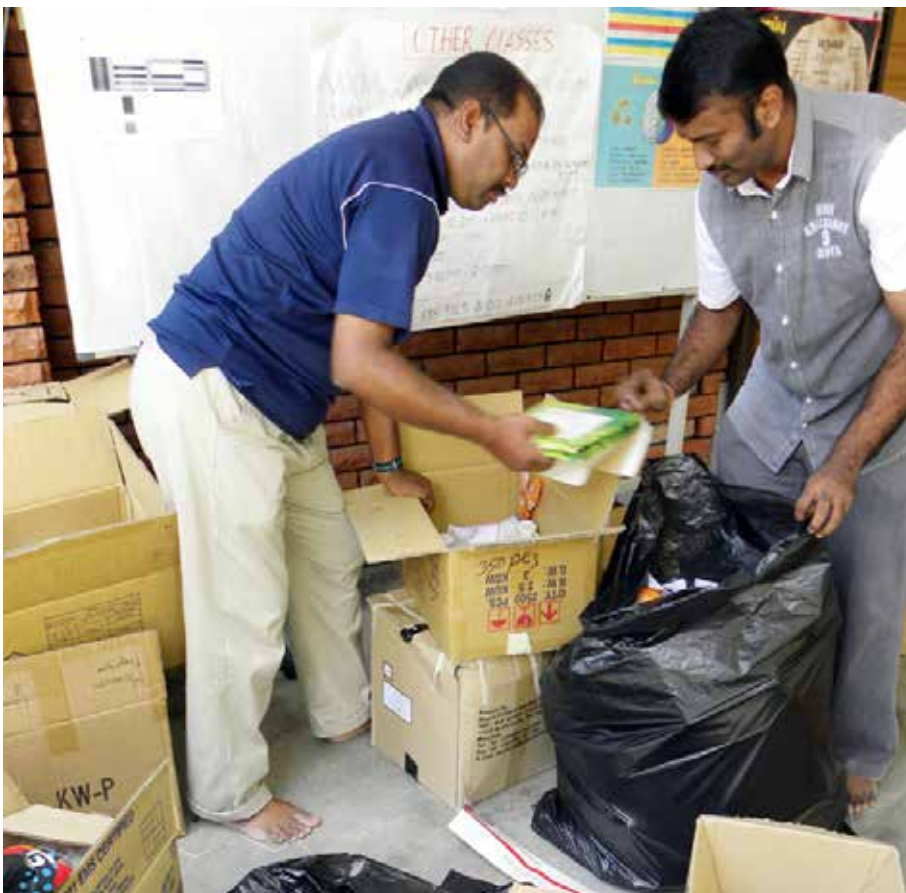
Children learn both solid waste segregation and organic waste composting at the Penang Suya Meiyarivagam centre. Parents and children bring their recyclables every Sunday to be segregated at the centre. The income from the sale is used to run the activities of the centre.